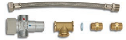
THERMOSTATIC MIXING VALVE