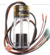
ULTRA PUMP SWITCH SR.