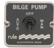
NON LIT BLACK PANEL