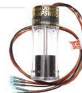
ULTRA PUMP SWITCH JR.