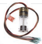
ULTRA PUMP SWITCH MINI