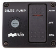
DELUXE BLACK PANEL