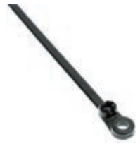
SCREW MOUNT WEATHER UV RESISTANT