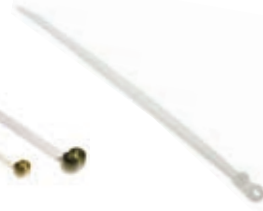
SCREW MOUNT STANDARD