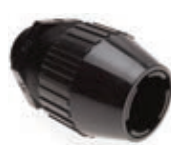
T/B ROUND STRAIGHT