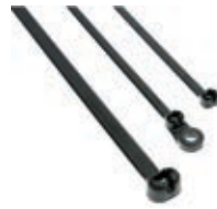
WEATHER UV RESISTANT